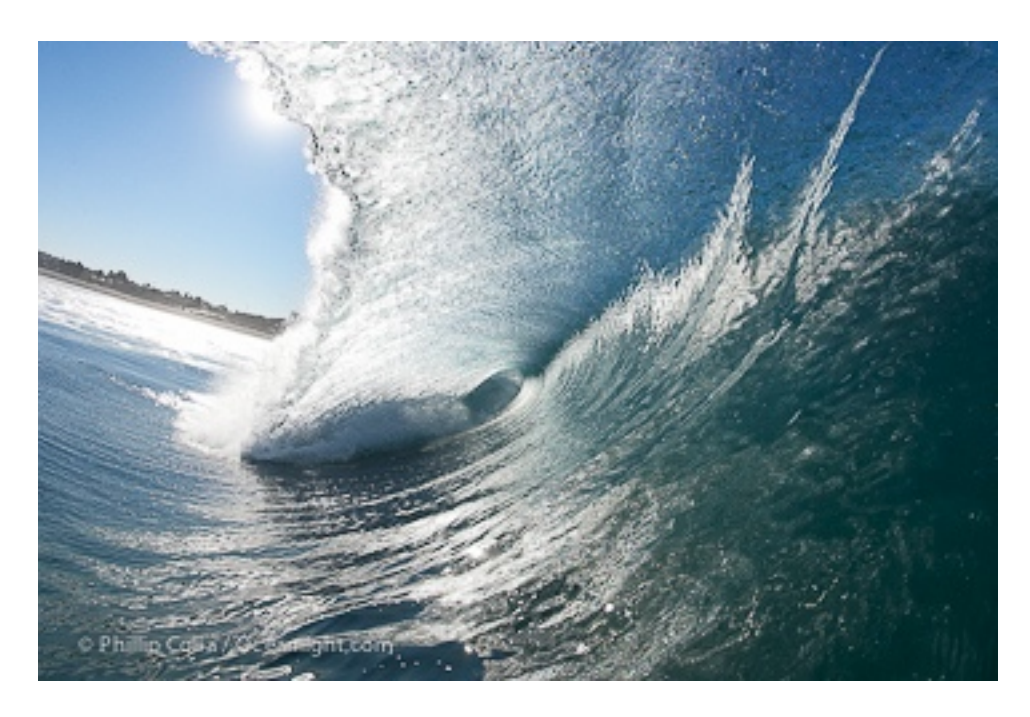
This is my favorite wave photo because it brings back memories of a great morning at Ponto, Carlsbad, just a couple minutes from my house. This was a big clean day and noone else was out. I had this wave, and many others, to myself this morning.

compensation ( \pm 2/3 stop). On a typical sunny morning in California the result of these settings is usually an exposure in the range f/8 @ 1/1000 to about f/11 @ 1/2000, with only the specular highlights along the crest of the breaking wave being clipped.