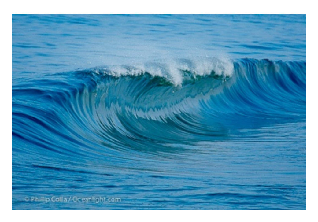
The Wedge, Newport Beach

I have lived within a mile or two of the Pacific Ocean for nearly my entire life, spending a lot of time at the beach over the years. My photography has always centered on ocean-oriented subjects, yet for years I somehow overlooked one of the most obvious marine subjects of all: waves. I have surfed, kayaked, bodysurfed, skimboarded, dived and swam on, in, through and under waves, but never really spent any time framing waves with my camera. However, as my travels have eased in recent years and I spend more time looking for new photographic subjects to exploit close to home, I have begun to view the ocean waves in my (figurative) backyard as a photographic subject with nearly endless creative possibilities.