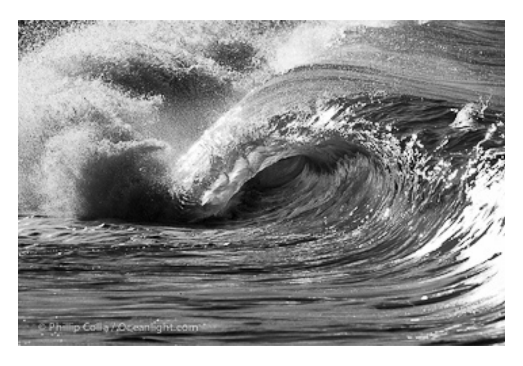
Warm Water Jetties, Carlsbad

constantly to look for the best angle given the direction, size and shape of the waves on a particular day. Typically the more oblique the angle the more pleasing the composition, looking down the axis of the wave. But where to achieve this? It takes some looking around and getting familiar with the nooks and crannies of the coastline. Rock jetties are great vantage points as they allow the photographer to move out from shore onto the water beyond the point at the which the wave breaks and yet maintain a low angle relative to the ocean surface. Piers allow for the down-the-barrel view as well, but the high angle looking down on the wave is sometimes difficult to work from. Anywhere there is a sharp bend in the coast and waves that break close to shore provides a vantage for looking down the length of a wave without actually getting wet. At surf contests, where photographers remain in place most of the day, tripods are the choice. But for moving around the beach and on jetties and piers I prefer the mobility of a monopod.