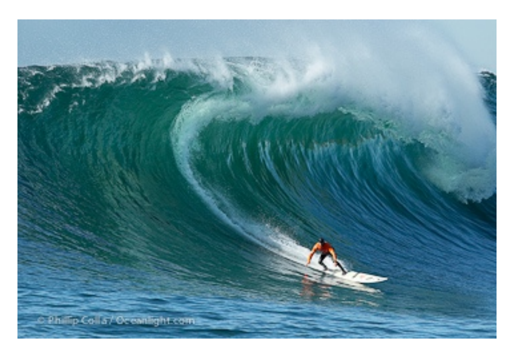
Mavericks, Half Moon Bay

The simplest waves to shoot are the ripples and oscillations found anywhere there is water: harbors, marinas, lakes, glass ocean. Here I look for abstract qualities: patterns that repeat or nearly so but that are also difficult to recognize when isolated from their surroundings, removed from their context. Usually it is not the wave itself but the background that is most important since background colors reflected on the smooth water dominate the image. I tend to use midrange telephoto focal lengths (e.g., 200mm, 300mm) so that I can frame out the surroundings and distractions, hopefully producing an image that is about abstraction and pattern. I know I've succeeded with one of these shots when a viewer says "Very cool! But what is it?"